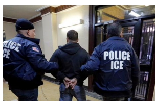
Immigration Detention Center